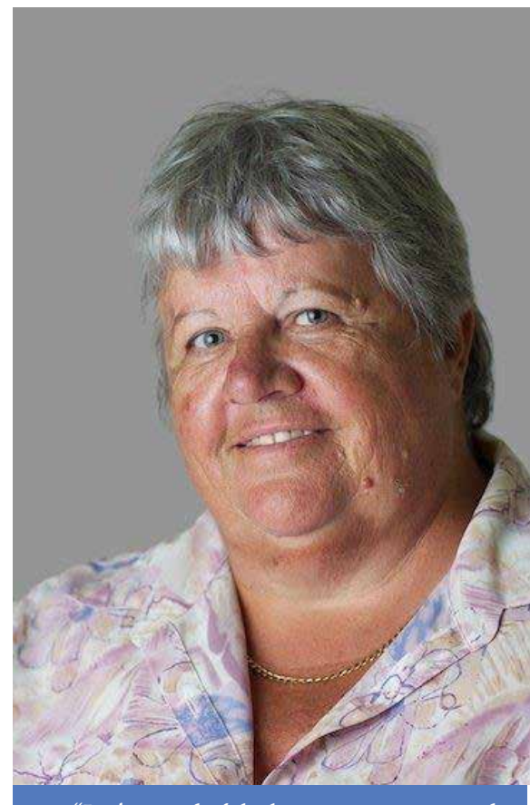
"Let's get rid of the barriers to success and focus on putting people back at the centre of our reason for being educators."

As the staff working in the tertiary education sector, we are no longer willing to accept such market ideals for our tertiary education system, and we will no longer